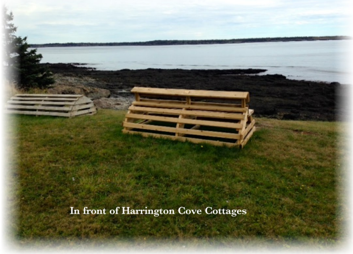
In front of Harrington Cove Cottages

Unfortunately, over the past years two have disappeared (also mysteriously) from Southern Head and we decided not to place another one in that location, too accessible to trucks and A.T.V.s. The memorial bench,