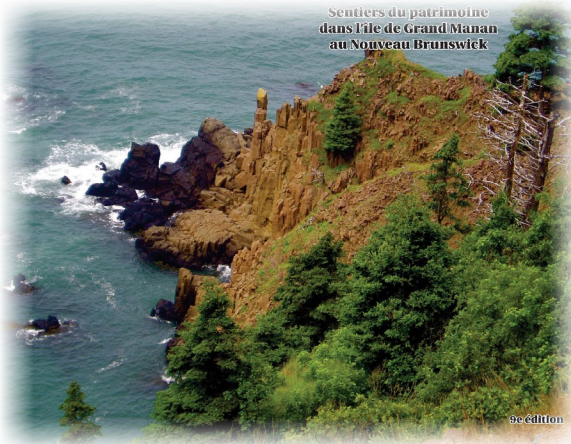
Pandora's Heads Head, from above