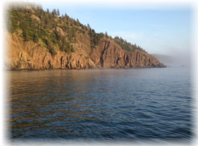
Pandora's Head, from the water