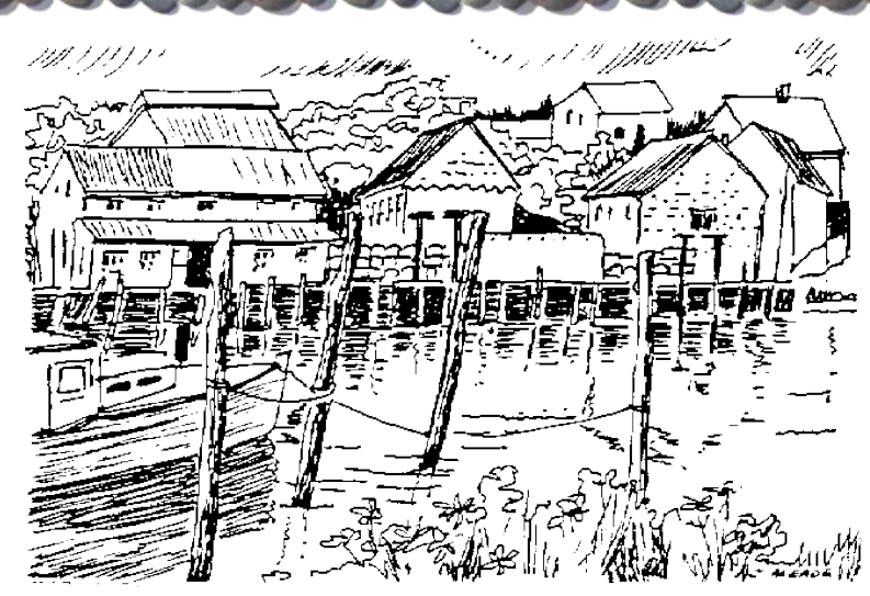
'Hemoglobin Hamlet' formerly Seal Cove